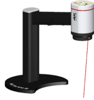
HD-015, U30 HD-017, U10