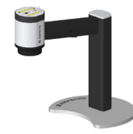
HD-010, C12 HD-010-C, C12 with SD-card Image Capture